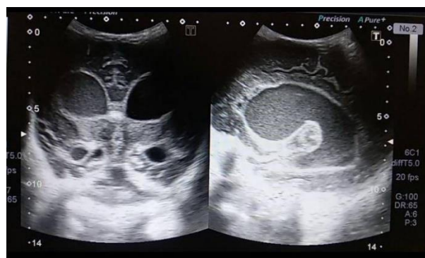
Figure. 2. Patient C., age 4.5 months.