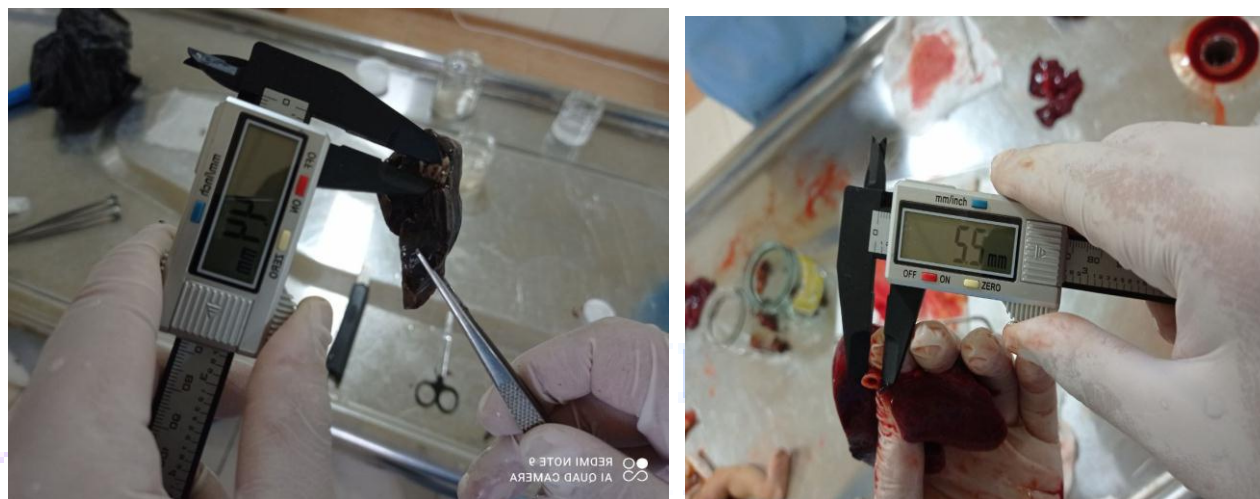
Figure 1. Infant lungs, 3-month period. Obtaining a share of extrapulmonary bronchi using a stangentsirkul.

The examination material was obtained from the following parts of the lungs: that is, it was studied by opening the right and left pulmonary bronchi from the split bronchi to the terminal bronchi. In our study, instrumental (using the shtangen circus), general histological, histochemical examination methods were used.